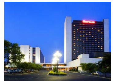
Sheraton Hotel—Bloomington, Minnesota

The Sheraton Bloomington Hotel is prepared for guest room reservations. Attendees can call (952)835-7800 and ask for AIRUM 2009 to reserve a room. $129 single/double, $139 triple, or