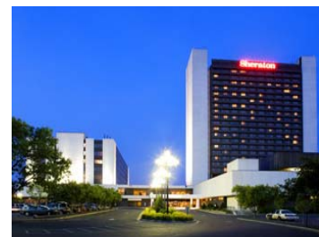
Sheraton Hotel—Bloomington, Minnesota

He has served on the National Academy of Sciences study panel evaluating the NIH minority research training programs, the Technical Advisory Committee for the National Survey of Postsecondary Faculty, the National Advisory